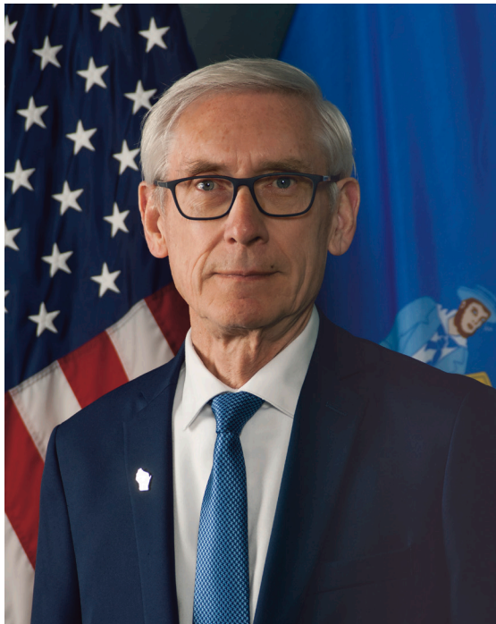
Governor Tony Evers